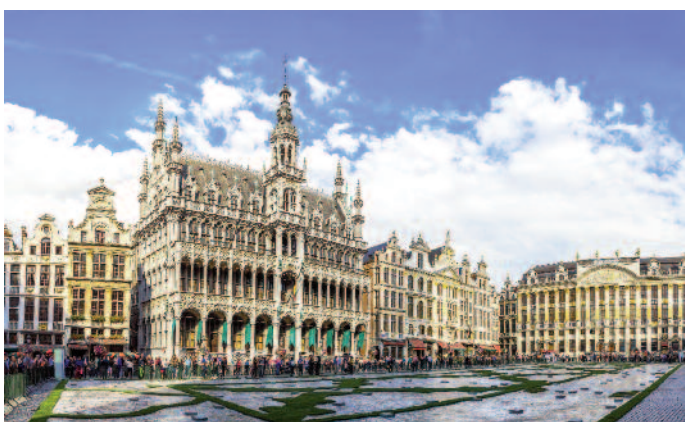
Brussels Grand Place