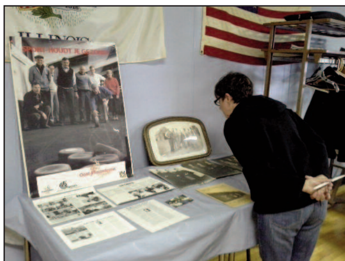
A dinner participant looks over part of the rolle bolle display. The photos and booklets date back to the early 1930s.