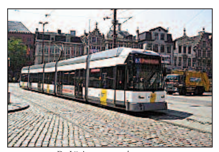
De Lijn's new extra-long tram.

Belgians are creative, and some of the names submitted to the transportation ministry were: Tramaconda, Tramzilla, Titramic, Supertramp, Trambo, and Traaaaaaam. Pretty "punny" names, don't you think? But none of them made the final list. That list included names like Anaconda, Limo, and Tramigo. The new tram is officially known as Albatros.