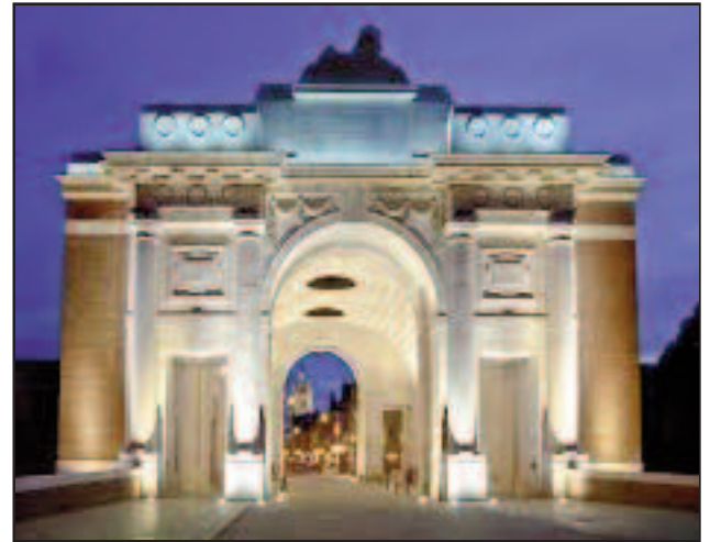
↑ Menin Gate Names of the Missing ↓