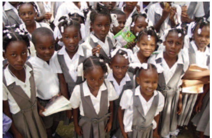
Uniformed Haitian school children of St. Anne's Parish.