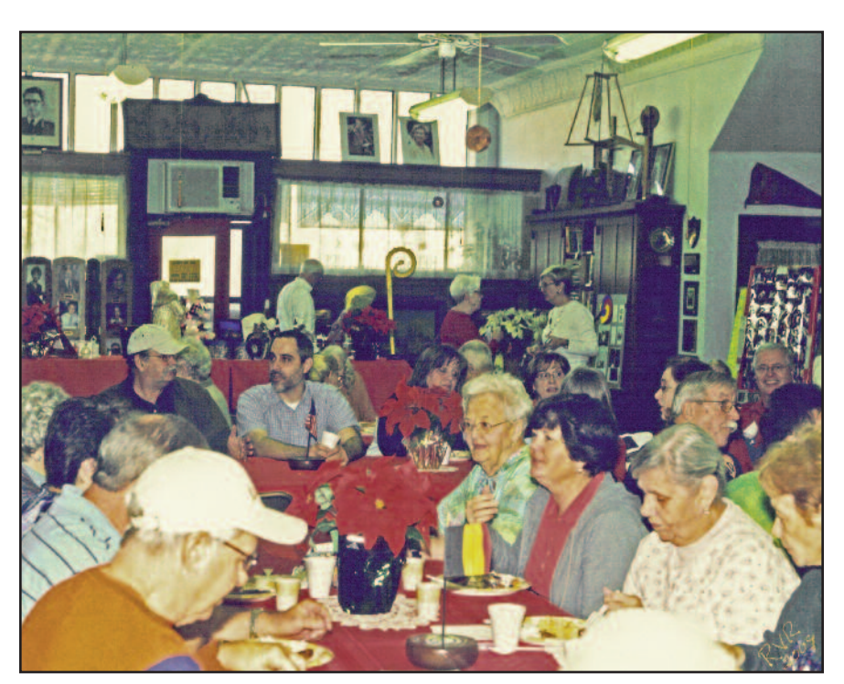
Part of the holiday crowd at the Center's waffle breakfast and visit by St. Nicholas.

Traditions do change with time. But one thing is constant – it's a time for families to come together to share and rejoice. How do you celebrate?