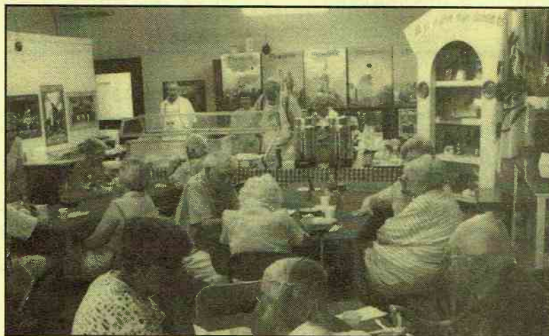
The Waffle Crew hard at work

Many Thanks to the volunteers. The next Waffle Breakfast is scheduled for Saturday morning, October 5 th from 8:00-12:00 . In case you haven't had the opportunity to attend one of these breakfasts, here's a photograph to pique your curiosity: