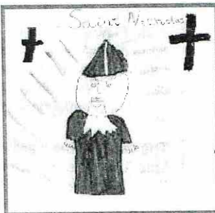
2 nd Place Brittany Yeocum